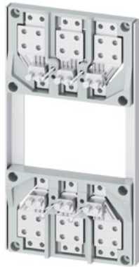
mounting base front connection accessory for: 3VA58/59, 3VA68/69