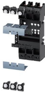
plug-in unit complete kit accessory for: circuit breaker, 3-pole 3VA61/62