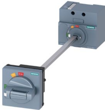
door mounted rotary operator standard IEC IP65 with door interlock accessory for: 3VA10/11