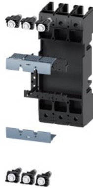
plug-in unit complete kit accessory for: circuit breaker, 3-pole 3VA20/21/22