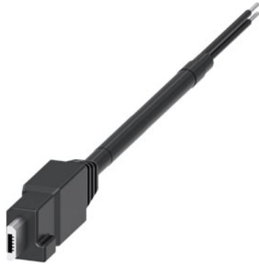
connecting cable for N-CT-3VA accessory for: external current transformers