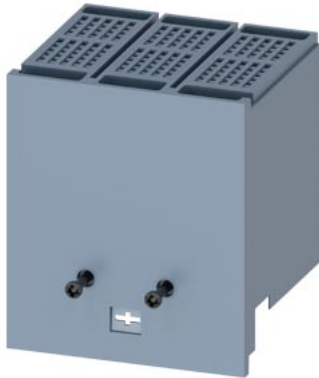
terminal cover extended 3-pole; 1 unit accessory for: 3VA51