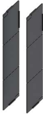
phase barriers; 2 units accessory for: 3VA12