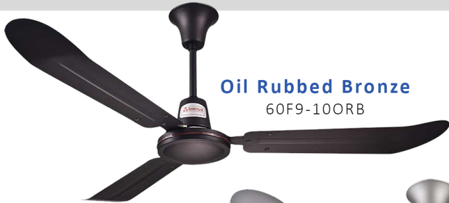
Oil Rubbed Bronze 60F9-10ORB