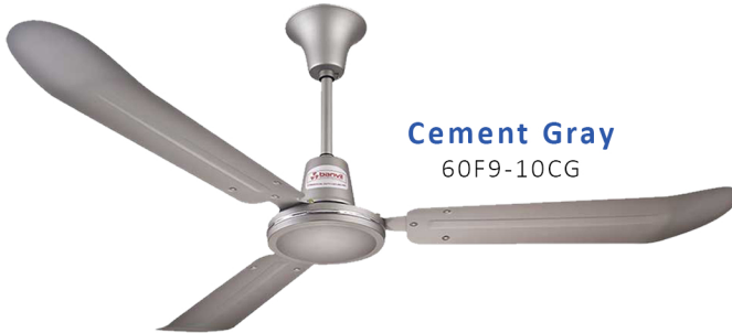
Cement Gray 60F9-10CG