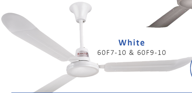
White 60F7-10 & 60F9-10