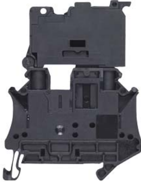
Terminal, screw terminal, fuse terminal for G fuse, 4 mm 2 , black