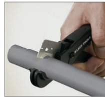
GUIDE HELPS CUT PIPE SQUARELY