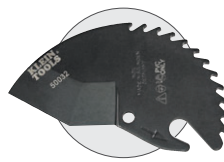
REPLACEMENT BLADE FOR 50031 50032