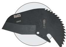
REPLACEMENT BLADE FOR 50034 50035