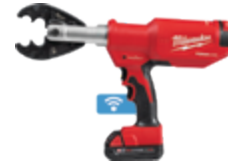
w/ O-D3 Jaw 2977-22O (2977-20 Tool-Only)