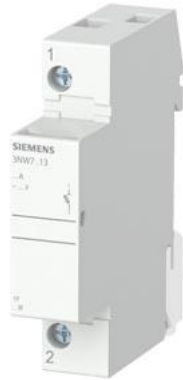
SENTRON, cylindrical fuse holder, 10x38 mm, 1-pole, In: 32 A, Un AC: 690 V