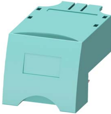
Cable connector size S00 Spring-type terminal