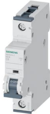
Miniature circuit breaker 230/400 V 6kA, 1-pole, C, 5 A