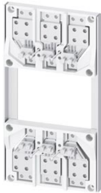
mounting base front connection accessories for: 3VA58/59, 3VA68/69