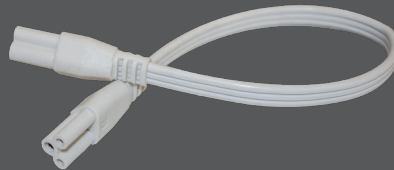
Linkable cable connectors (12", 48", 72", 96")