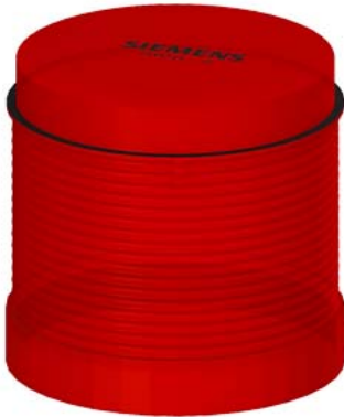
Single-flash light element, w. built-in electronic flash, red, 115 V AC, Diameter 70 mm