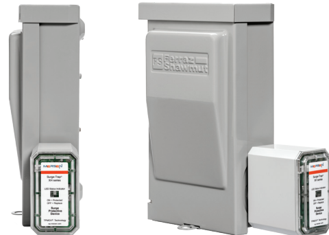
Ideal for Air Conditioning Disconnect Applications