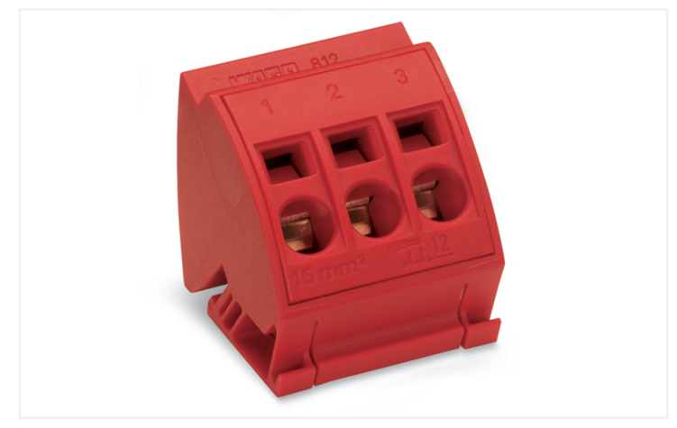
Color: ■ red

Common potential terminal block, 812 Series, CAGE CLAMP®