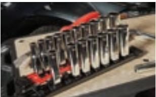
Includes Storage Rail