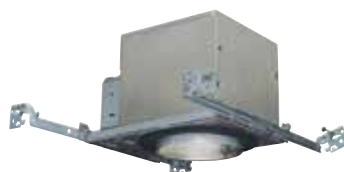
12¼" L x 6¾" W x 6" H Ceiling cutout: 4½" diameter