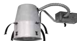
12" L x 4¼" W x 5½" H Ceiling cutout: 4⅞" diameter