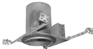
11½" L x 6¾" W x 7½" H Ceiling cutout: 5½" diameter