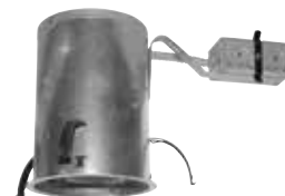
12½" L x 5¾" W x 7½" H Ceiling cutout: 5½" Diameter