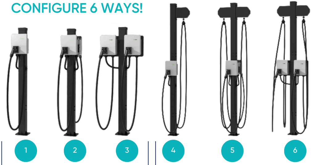
Universal Pedestal Base