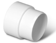
V139 Inlet Valve Extension