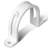
V140 Tubing Strap 2 in. (51 mm) dia.