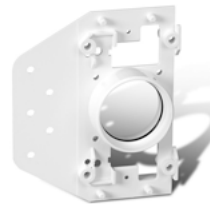
V144 Plastic Mounting Plate