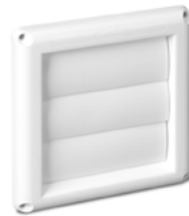
V142 Exterior Wall Cap