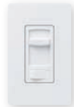
Skylark Contour™/C•L* Gloss colors