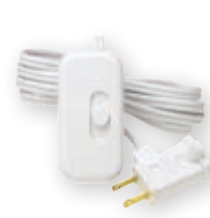
Credenza®/C•L Black (BL), White (WH), and Brown (BR)