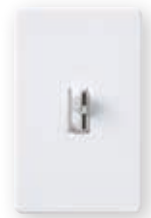
Ariadni®/C•L Gloss colors Coming Soon