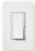
Diva®/C•L Gloss and Satin Colors®